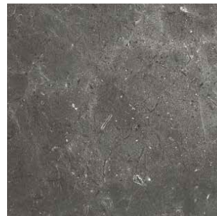
PI7 06 BLACK V3 60x60cm - matt 30x60cm - matt . structured

RANDOMNESS: 60x60cm – 9 faces 30x60cm – 12 faces