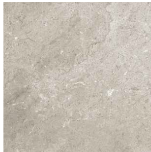
PI7 02 BROWN V3 60x60cm - matt 30x60cm - matt . structured