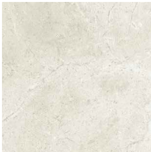
PI7 01 BEIGE V3 60x60cm - matt 30x60cm - matt . structured