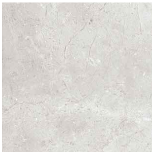
PI7 04 GREY V3 60x60cm - matt 30x60cm - matt . structured