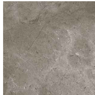
PI7 03 DARK BROWN V3 60x60cm - matt 30x60cm - matt . structured