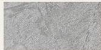
30x60cm | MATT . STRUCTURED