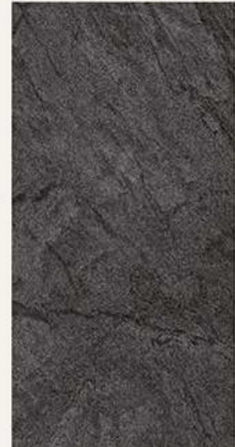
60x120cm | MATT . STRUCTURED