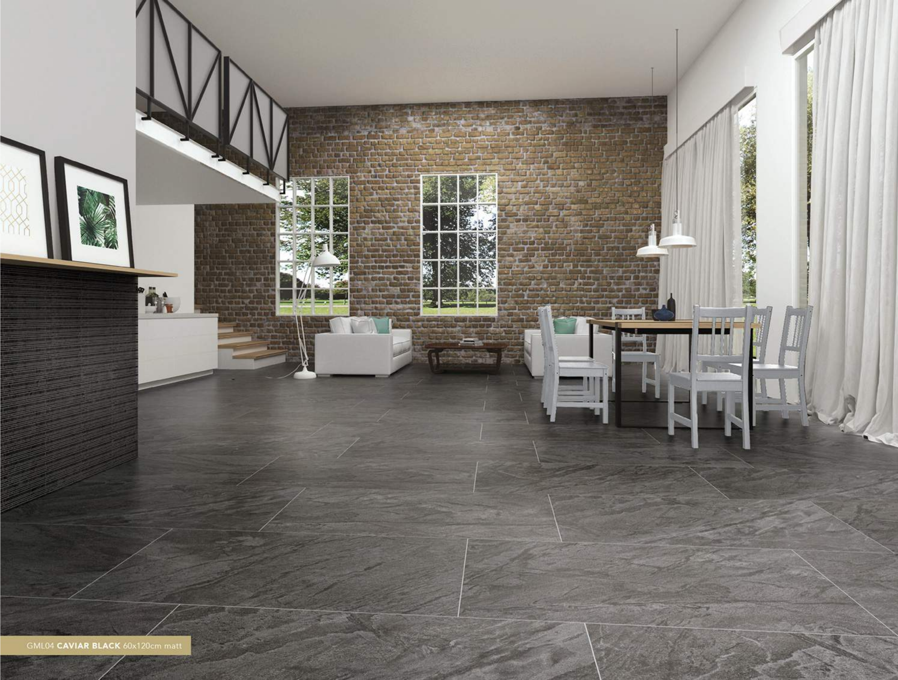
GML04 CAVIAR BLACK 60x120cm matt