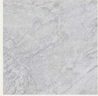
60x60cm | MATT . STRUCTURED