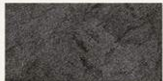
30x60cm | MATT . STRUCTURED