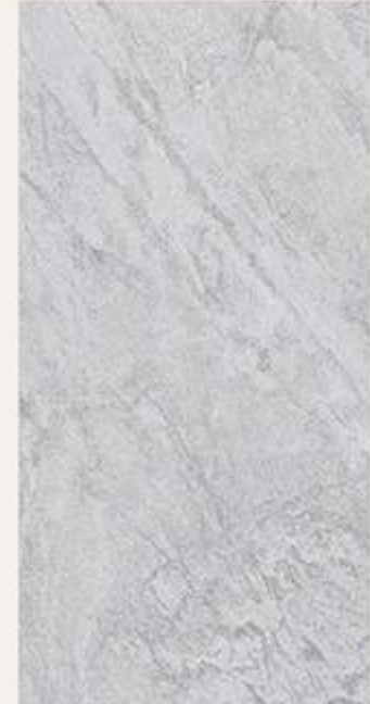
60x120cm | MATT . STRUCTURED