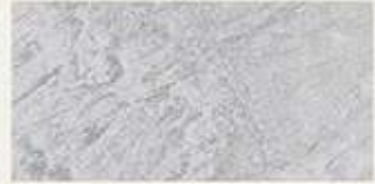
30x60cm | MATT . STRUCTURED