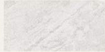
30x60cm | MATT . STRUCTURED