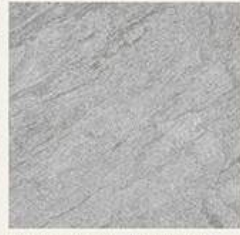
60x60cm | MATT . STRUCTURED