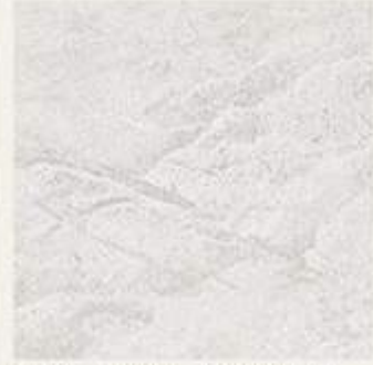
60x60cm | MATT . STRUCTURED