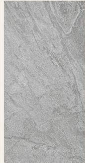
60x120cm | MATT . STRUCTURED