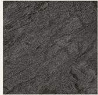
60x60cm | MATT . STRUCTURED