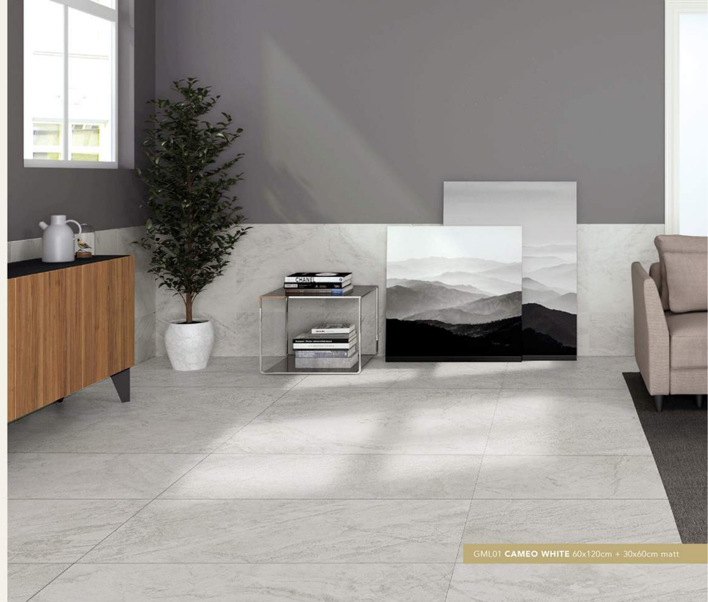
GML01 CAMEO WHITE 60x120cm + 30x60cm matt