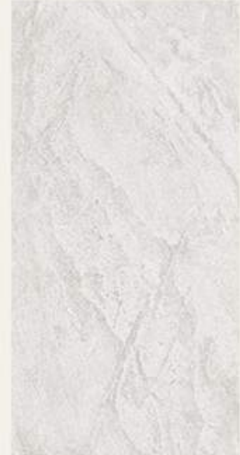
60x120cm | MATT . STRUCTURED